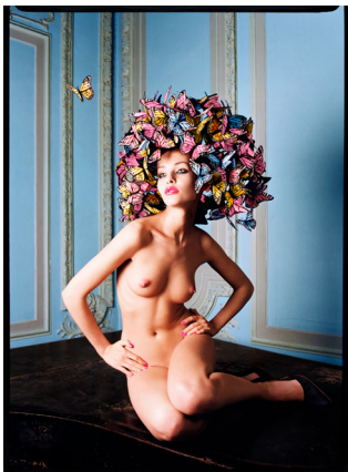
David LaChapelle MOSCOW (Nature's Naked Loveliness) , 2003 C-Print on Dibond framed 246 x 183 cm 96 7/8 x 72 1/8 in

© Jaclyn Conley, courtesy of Maruani Mercier, Belgium